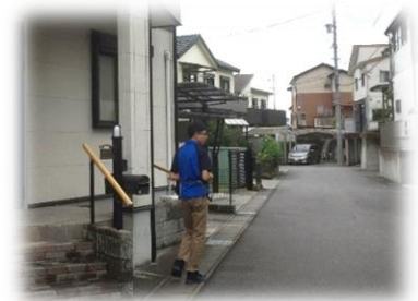
Getting the good news of salvation out through gospel tracts in Anjo city.