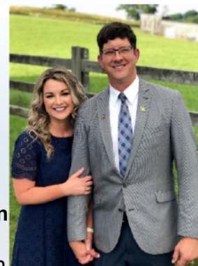
Outside of church on our 1st Sunday in Brazil